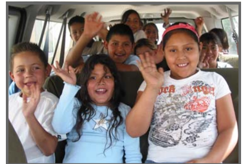
"Hey!" Here are some of the kids I pick up for Kids' Club on Wednesday afternoons.