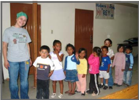
Here I am with my tots...the 3 & 4 year-olds of Wednesday afternoon Kids' Club.

*for tax purposes, please include a separate piece of paper with my name on it. Thank you!